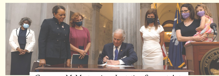
Governor McMaster signs Lactation Support Act.

paid break time or mealtime, to express breast milk. However, an employer will be not be held liable if it takes reasonable efforts to comply with the Lactation Support Act.