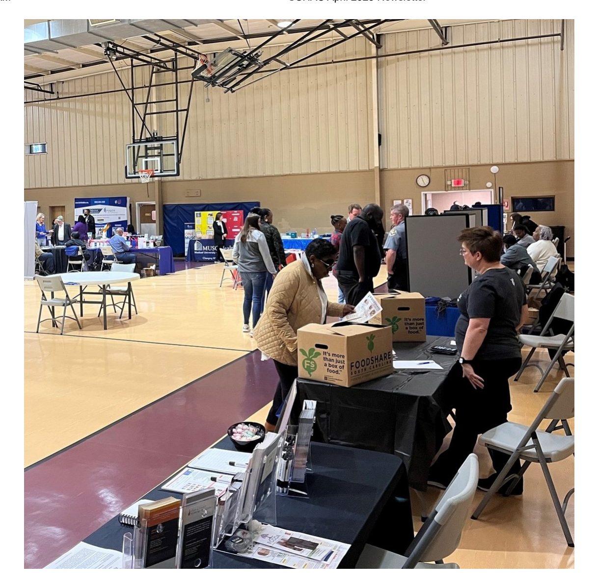
Vendors and veterans at the VA 2nd annual expo