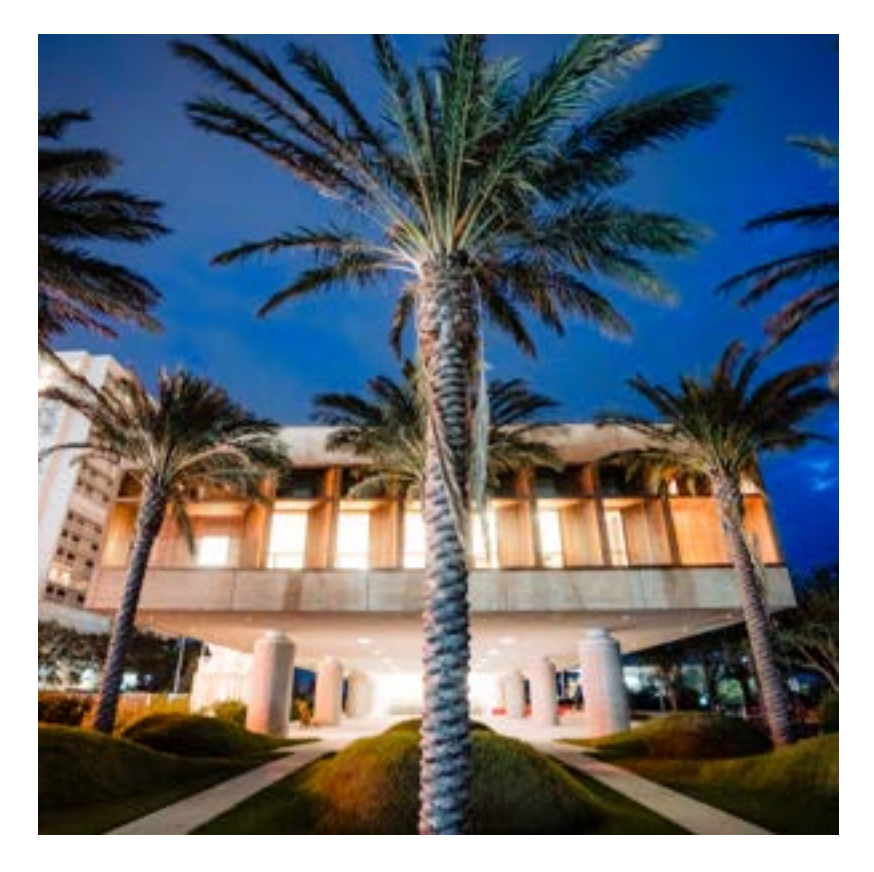
Entrance to the International African American Museum in Charleston, SC.