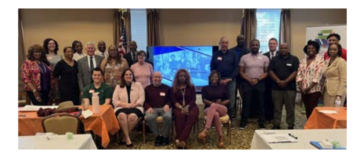
FMACC training participants