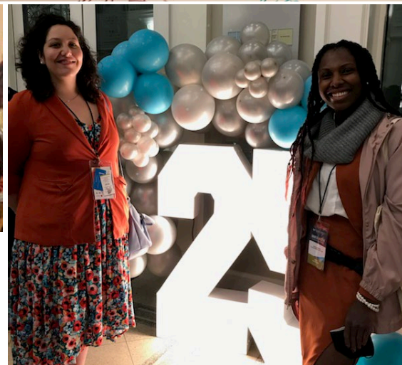
Top Left to Bottom Right: Day 1 Opening Presentation slide, Signing of the Urgency of Now banner, Equity Peer Network small group, Consultants at TogetherSC's 25th-anniversary reception

For resources from the TogetherSC 2022 Nonprofit Summit: https://summit.togethersc.org/resources/